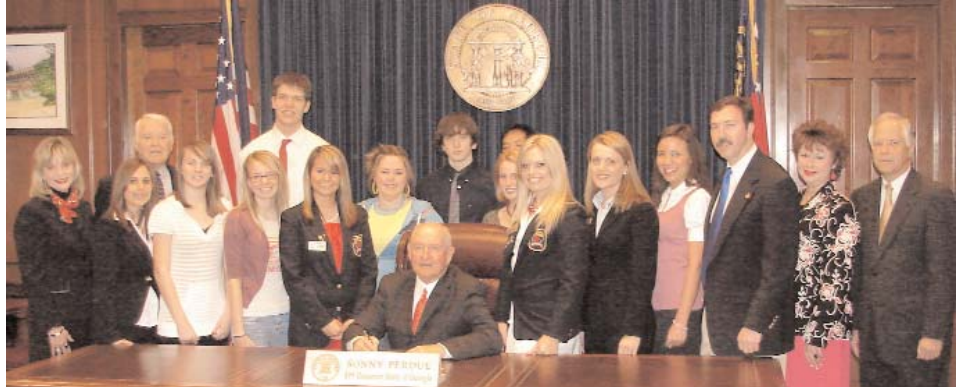
Georgia Governor Sonny Perdue signs the EntrepreneurshipWeek USA proclamation on February 22, 2007. Representatives and students from Global Achievers, the Georgia Department of Education, and Georgia REAL are present.